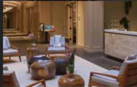
STILLWATER SPA & SALON