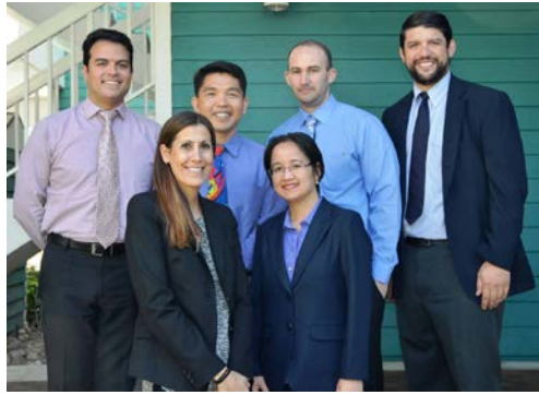
Doctors of Park Family & Cosmetic Dentistry

Park Family & Cosmetic Dentistry 690 Goodlette Rd. N, #100 Naples, FL 34102