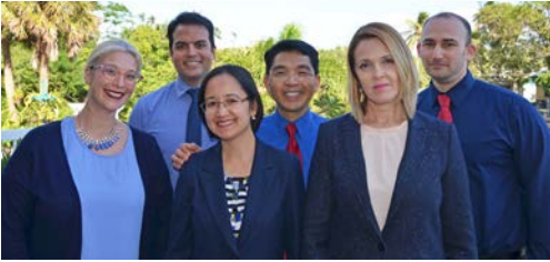
Doctors of Park Family & Cosmetic Dentistry

Park Family & Cosmetic Dentistry 690 Goodlette Rd. N, #100 Naples, FL 34102