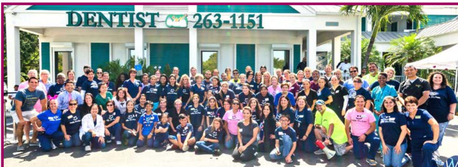
4th Annual Dentistry From the Heart - 2017

festive. Some even set up booths the day of the event. We look forward to seeing you there!