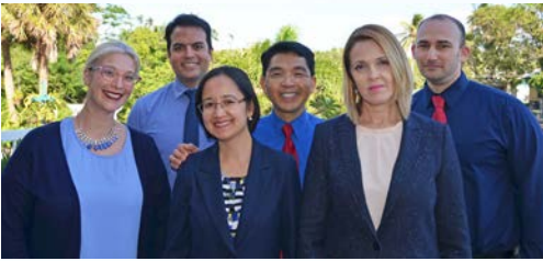
Doctors of Park Family & Cosmetic Dentistry

Park Family & Cosmetic Dentistry 690 Goodlette Rd. N, #100 Naples, FL 34102